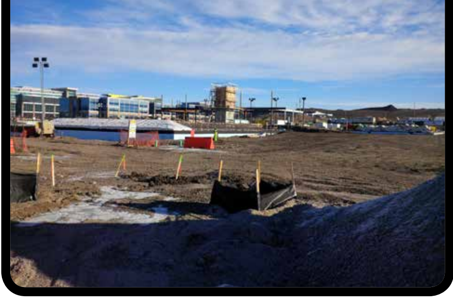
Construction at Quarry Park Recreation Centre, December 2014

The 95,000 sq. ft. facility will also act as a community hub by connecting with existing walk and bike pathways in the surrounding neighbourhoods and along the Bow River. ONE CITY ONE COMMUNITY